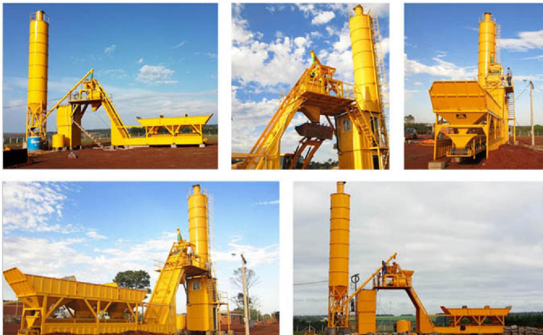
Y-ZS25 Portable concrete plant basic performance parameters