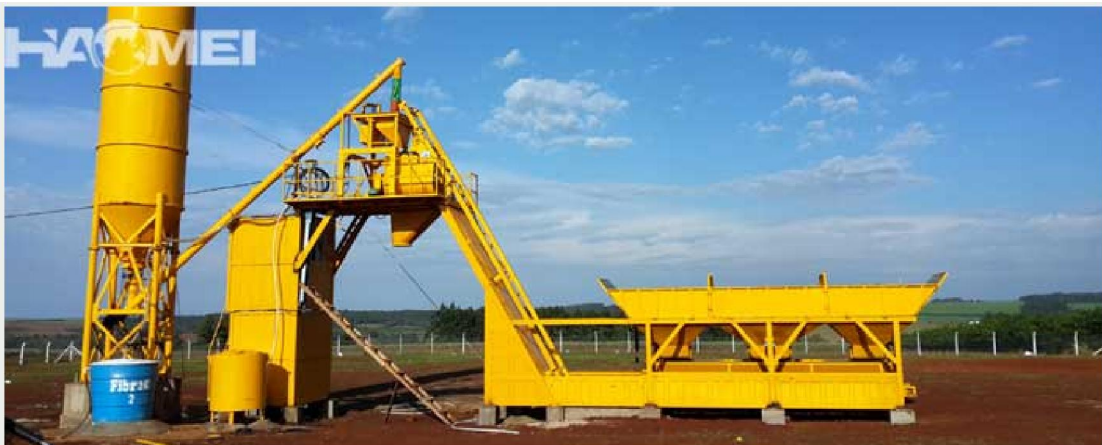
General layout of YHZS25 portable concrete plant

YHZS25 portable concrete plant is a new type ready mix batching equipment which is movable by trailing. It is uniquely and novelly designed with a simple and compact structure. One trailing unit assembles a whole working set of aggregating, weighing, conveying and mixing system, enabling it great overall mobility. By absorbing new technologies from overseas and domestic, The portable concrete plant has such characteristics as accurate weighing, homogeneous and efficient mixing, fast and clean delivery, convenient to move and operate, safe trailing, etc. It is the ideal choice for projects that require frequent movement from one construction site to another.